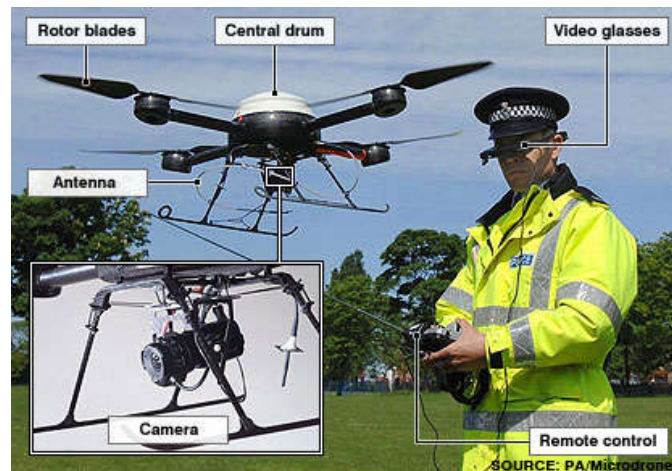
Fig. 7 SURVEILLANCE UAVs