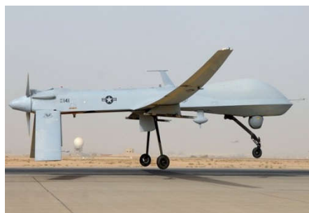
Fig. 5 RQ-1 PREDATOR

The RQ-1 Predator, probably the best-known modern UAV, made its first test flight in 1994. Produced by General Atomics Aeronautical Systems— based on a design by Abraham Karem , a former engineering officer for the Israeli Air Force—it was designed for “long loiter” reconnaissance work. The RQ-1 has evolved, and today its variants patrol the U.S.-Mexico border, collect air samples for scientific research, and unleash Hellfire air-to-ground missiles on military targets.