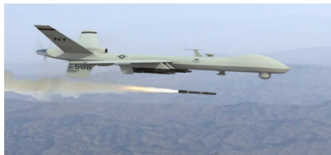
Fig. 9 WAR-FARE UAV