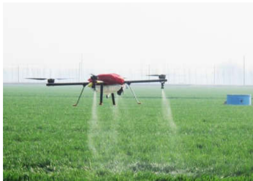
Fig. 6 AGRICULTURAL UAVs

As an added safety net with the flip of switch your Precision Drone will return to its original takeoff location