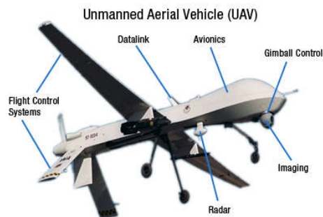
Fig. 1 Model of UAV

Unmanned Air Vehicles (UAVs) play a predominant role in the modern day warfare where emphasis is on surveillance, intelligence-gathering and dissemination of information. Within a few decades, these systems have evolved from performing a single role/mission to performing multiple missions like surveillance, monitoring, acquiring, tracking and destruction of target with the use of advanced technologies. UAVs serve as unique tools, which broaden battlefield situational awareness and the lowest tactical levels. A distinct advantage of UAVs is their cost-effectiveness. They can be developed, produced [1], and operated at lower costs compared to the cost of manned aircraft. The relative savings in engines, airframes, fuel consumption, pilot training, logistics, and maintenance are enormous. The biggest advantage of UAVs, however, is that there is no risk to human lives. Unmanned platforms are the emerging lethal and non-lethal weapons of choice and have transformed the way the armed forces now prosecute operations. The probability of losing reconnaissance platforms to enemy fire is quite higher, thus making UAV a better option. UAVs are mainly used by an organization for aerial maps and photography. They are also used in the military as weapon carrier and secret war attack.