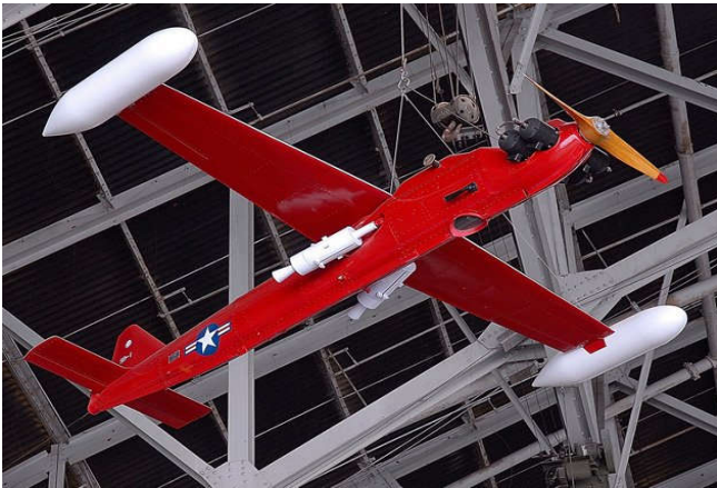
Fig. 4 FIRST RECONNAISSANCE DRONE

Reginald Denny's Radioplane Company, which was acquired in 1952 by Northrop Aircraft Incorporated, led the way in post-World War II UAV development. While most of the drones designed and produced during this period were used for target practice, 1955 saw the U.S. Army's first reconnaissance drone [4], the Northrop Radioplane RP-71 Falconer (designated the SD-1 by the Army), based on a target vehicle design. Launched by two rockets and recovered by parachute, the Falconer carried a still film camera and could transmit crude video.