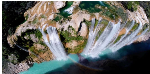
Fig. 8 TAMUL WATERFALL PIC FROM A UAV

Mapping zones/areas etc. are an important part of Geographic Information Systems, and one which is simplified primarily by the use of microdrones. Compared to conventional aircraft, using a microdrone to carry out such mapping tasks is much easier and more efficient. Several macros are integrated into the mdCockpit application software, which take away much of the effort in planning a mapping job. Using a particular macro, the flight path over a specific area can be generated automatically